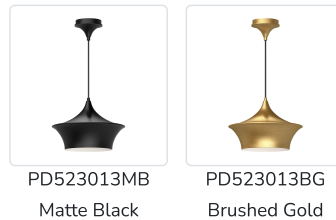
PD523013MB Matte Black